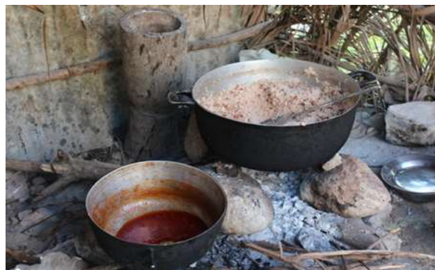
Volunteers cook the noon meals on school grounds.

Trinity HOPE is a ministry that feeds thousands of hungry children, teachers and cooks each day in Christian schools spread throughout Haiti. This is the only meal nearly 50% of those served will eat in a 24-hour period. Children receive a nutritious bowl of rice (or corn) and beans, with a high-protein mix of tomato paste, dried herring, oil, maggi (seasoning) and water. The special mix was developed by a Vanderbilt University nutritionist. Approximately 62% of Haitians suffer from malnutrition.