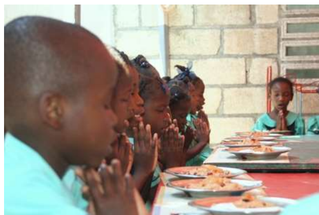
prayers before meal

Every school Trinity/HOPE feeds is a Christian school, actively teaching the Gospel of Jesus Christ on a regular basis. Many schools are tied to the local Christian church. Approximately 60% of the Haitian population practices Voodoo. Statistics show about 95% of the children fed (physically) and FED (spiritually) through this program come to believe in Jesus Christ.